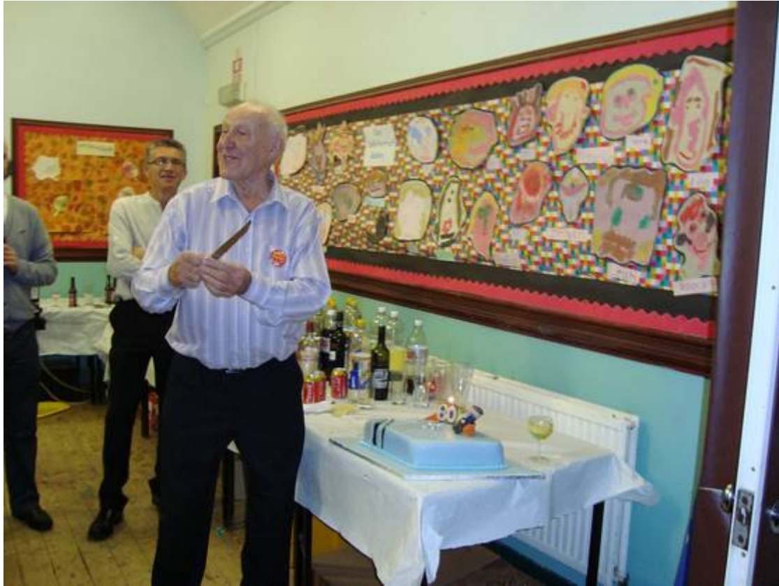
Let's have a nibble.