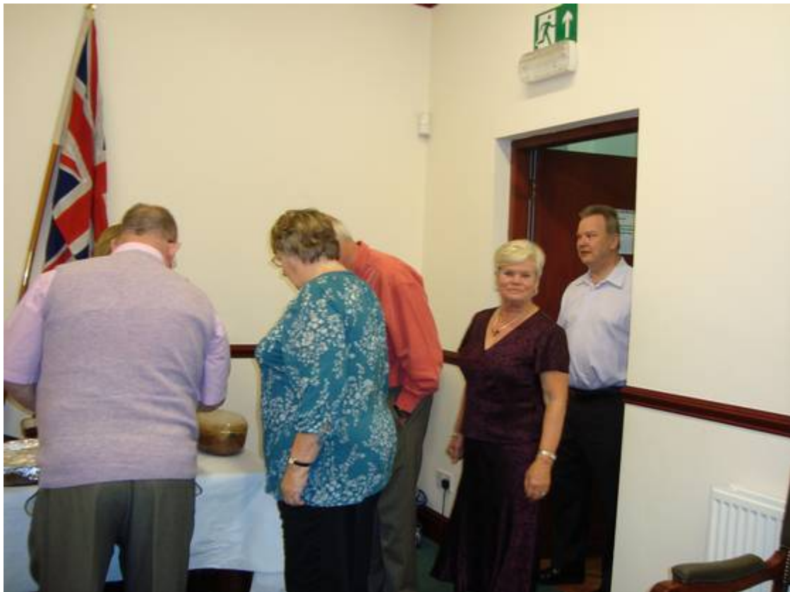
Wine Circle first for the food.