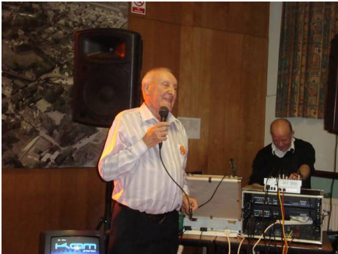
Unaccustomed as I am...